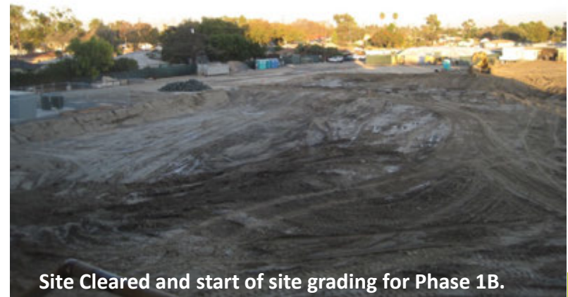
Site Cleared and start of site grading for Phase 1B.