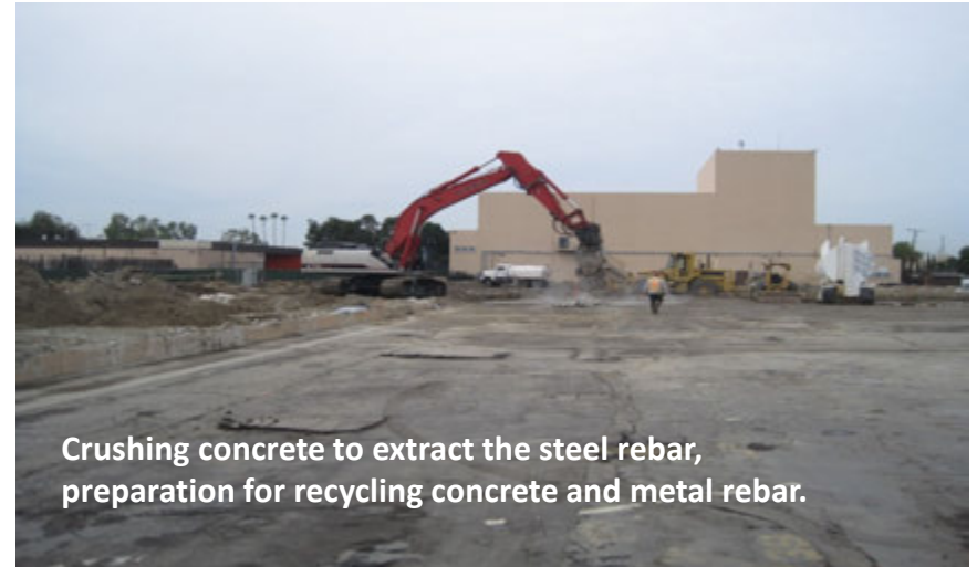
Crushing concrete to extract the steel rebar, preparation for recycling concrete and metal rebar.