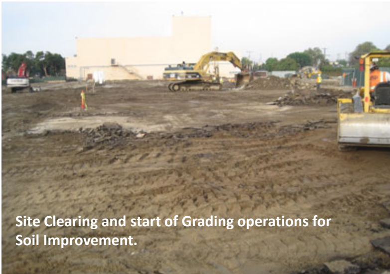
Site Clearing and start of Grading operations for Soil Improvement.