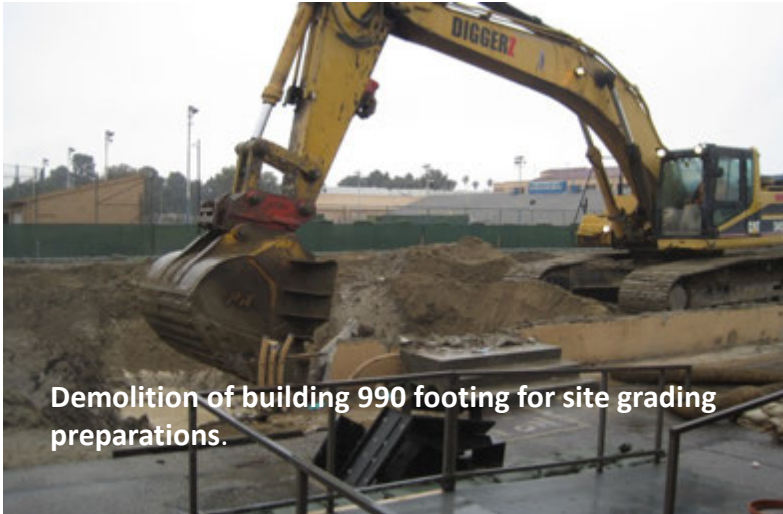
Demolition of building 990 footing for site grading preparations.