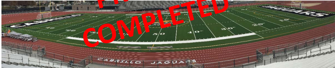
Long Beach Unified School District