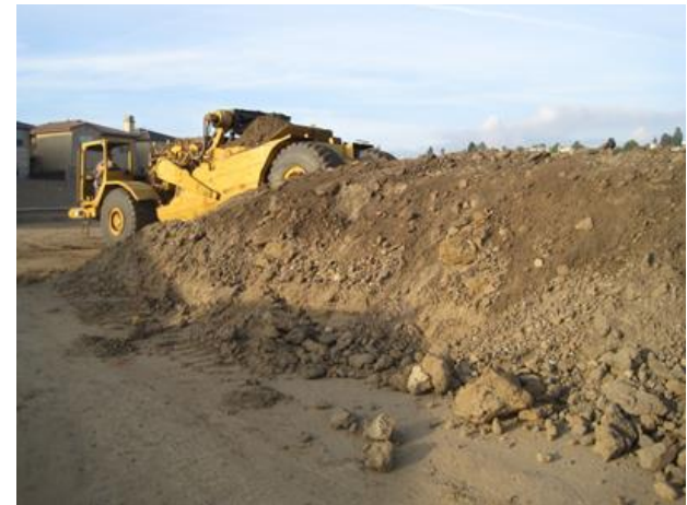
Long Beach Unified School District