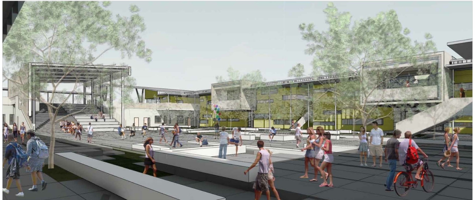
View Of Central Quad