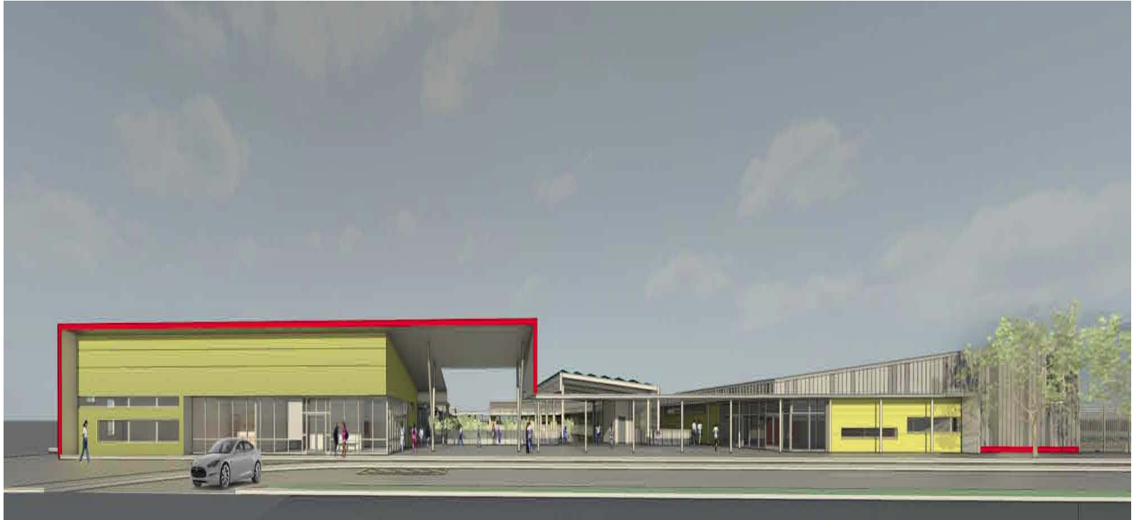
Main Entry Of School