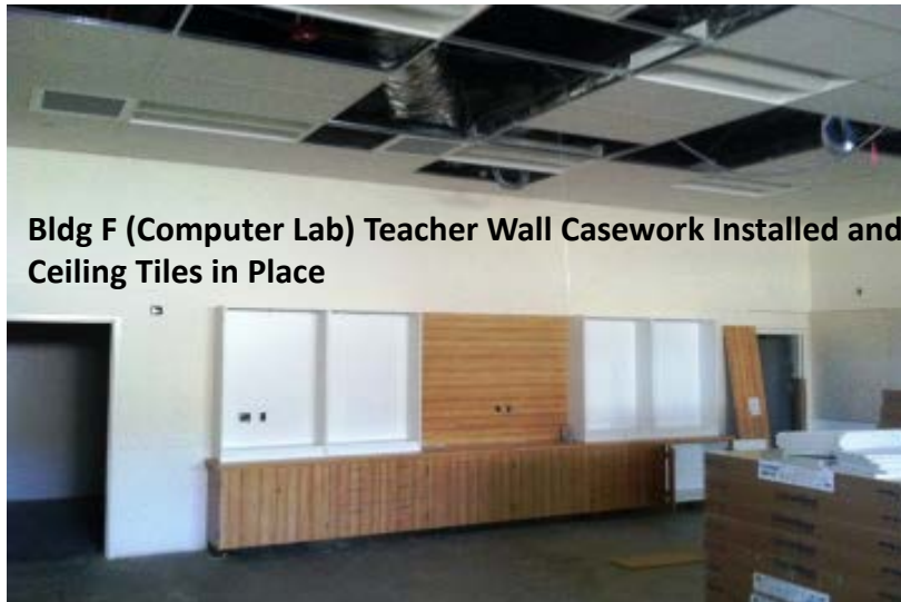
Bldg F (Computer Lab) Teacher Wall Casework Installed and Ceiling Tiles in Place