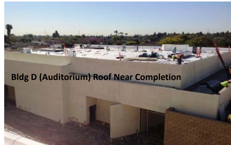
Bldg D (Auditorium) Roof Near Completion