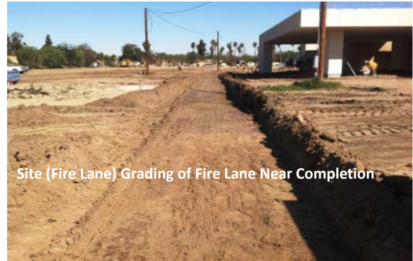
Site (Fire Lane) Grading of Fire Lane Near Completion