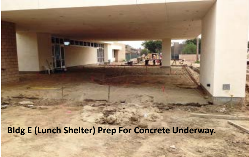
Bldg E (Lunch Shelter) Prep For Concrete Underway.