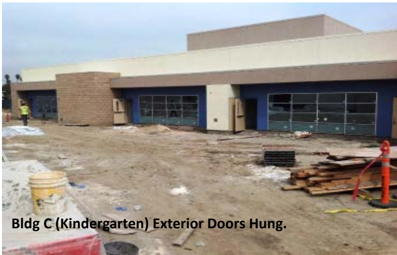
Bldg C (Kindergarten) Exterior Doors Hung.