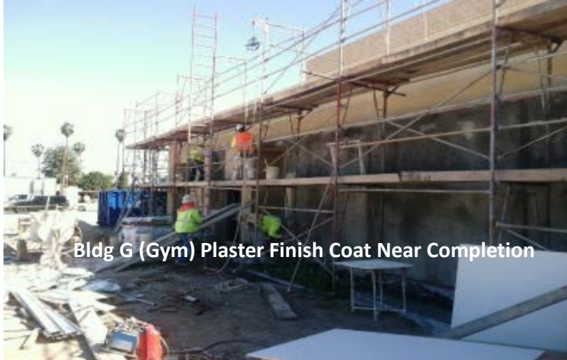
Bldg G (Gym) Plaster Finish Coat Near Completion