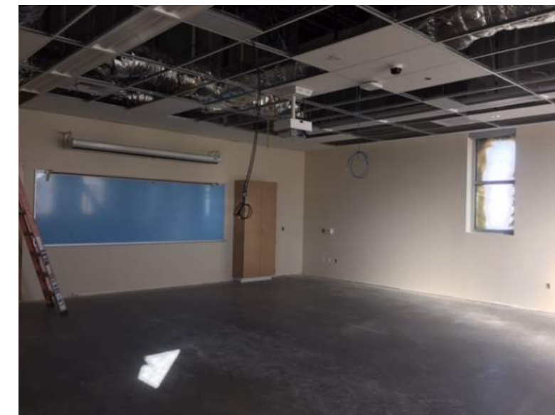
Building L: 1st Floor Classroom