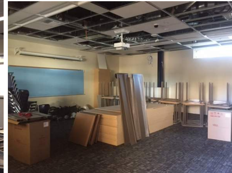
Building L: 2nd Floor Classroom