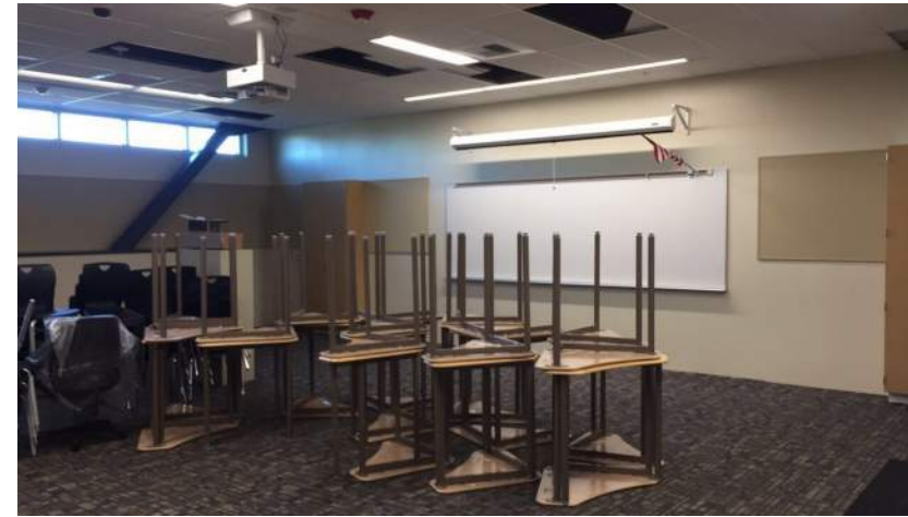
Building K: Classroom