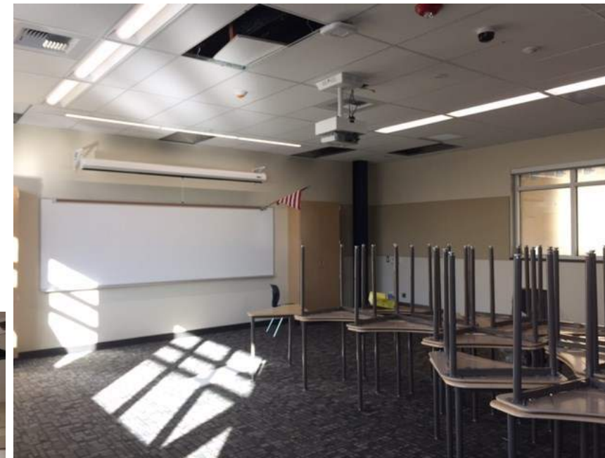
Building K: Classroom