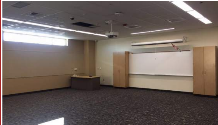
Building J: Piano Room