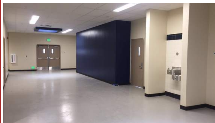
Building J: 2nd Floor Corridor