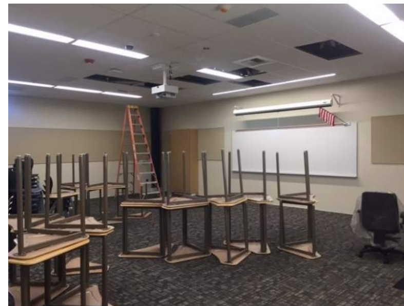
Building K: Classroom