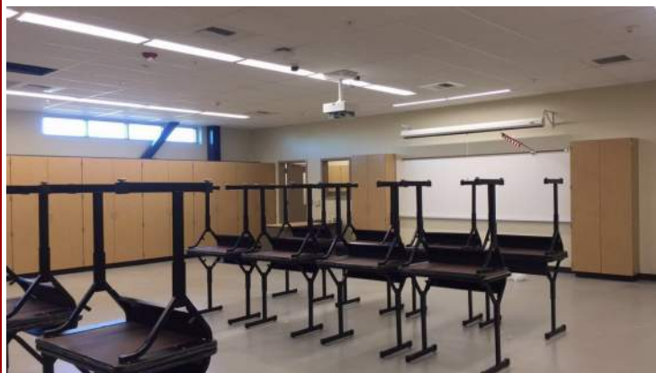
Building J: Classroom

Building J: Final cleaning, door hardware, and window coverings are in progress. Flooring in the 1st floor Black Box is wrapping up. Cable trays in the TV Studio is underway. Expansion joint cover assemblies are being installed at Stair #2.