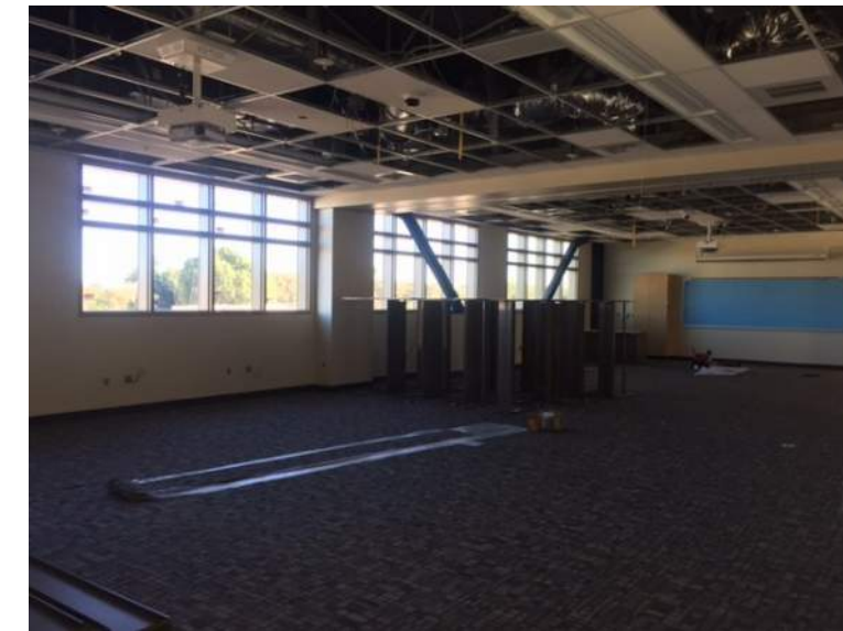
Building L: 2nd Floor Classroom