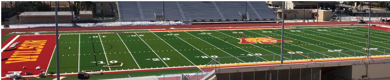
Wilson HS - Track & Field (Wilson Track/Field)