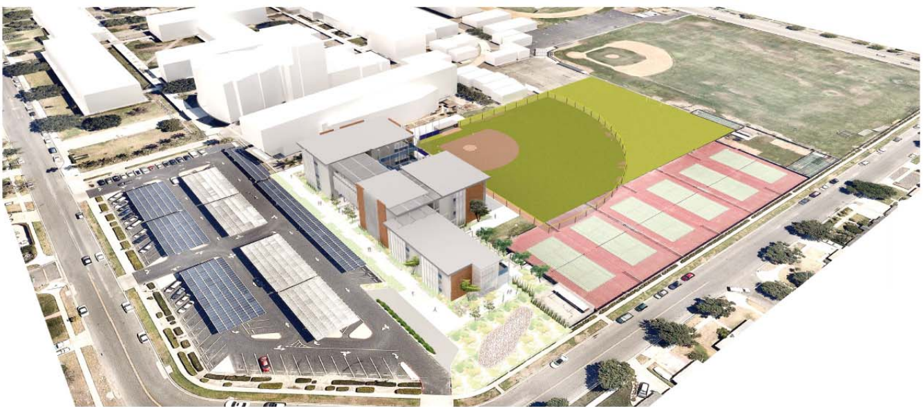
Perspective Renderings Aerial View from Southwest