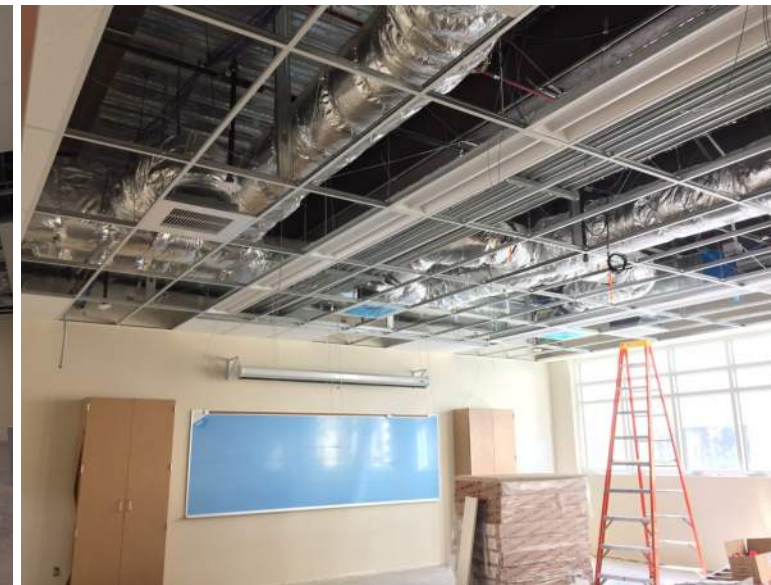
Building K Classrooms.