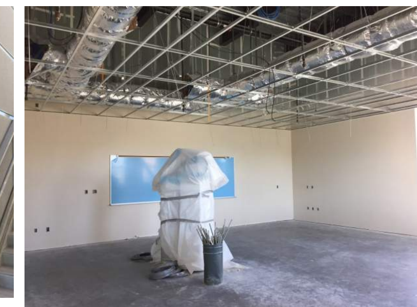
Building L 1st Floor Classrooms.