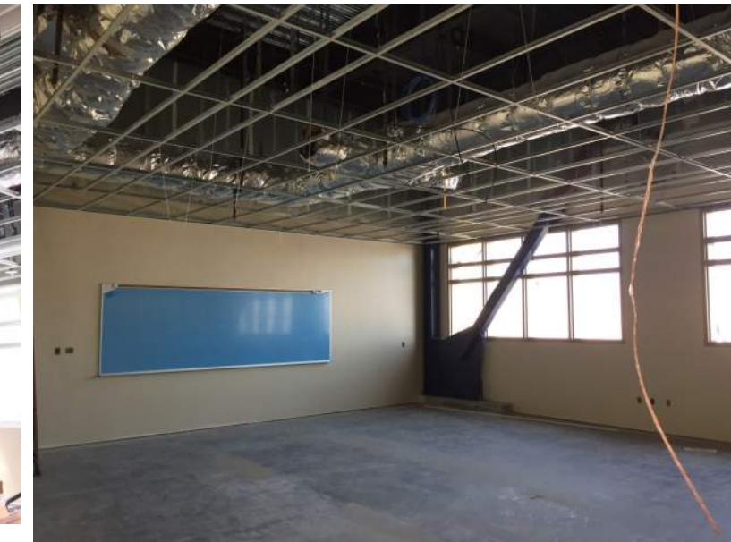
Building L 2nd Floor Classrooms.