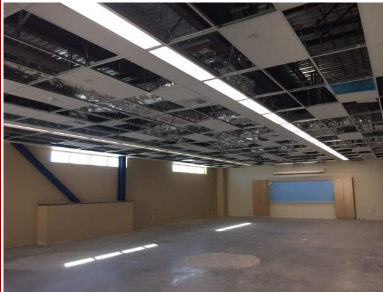
Building J 2nd Floor Classrooms.