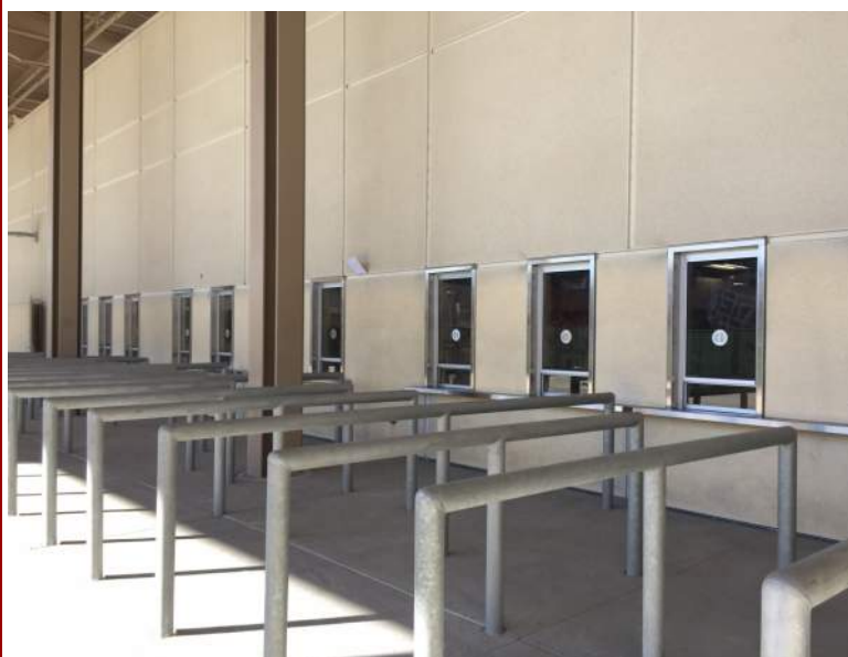
Building J Serving Area.