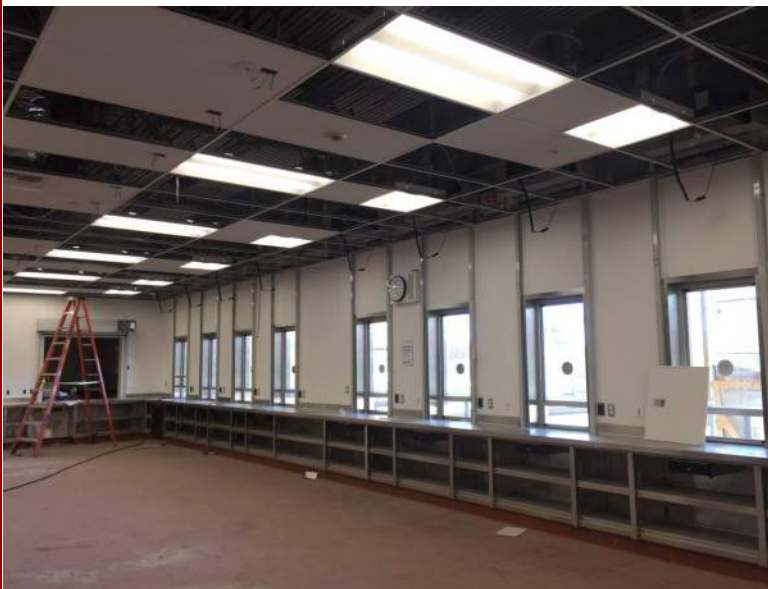
Building J Kitchen Area.