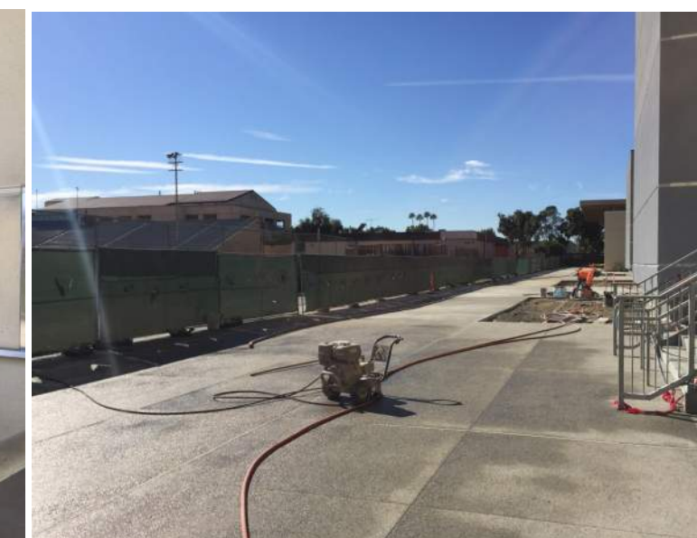
65th Street Site Work.